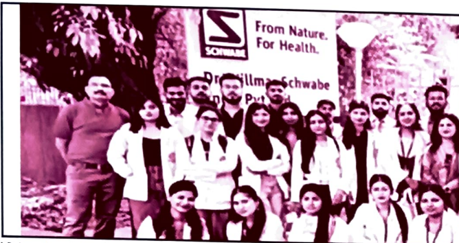
Visit to the state of the art Homoeopathic Medicine Manufacturing Unit, Dr. Willmar Schwabe, India Pvt. Ltd. at Noida along with students.